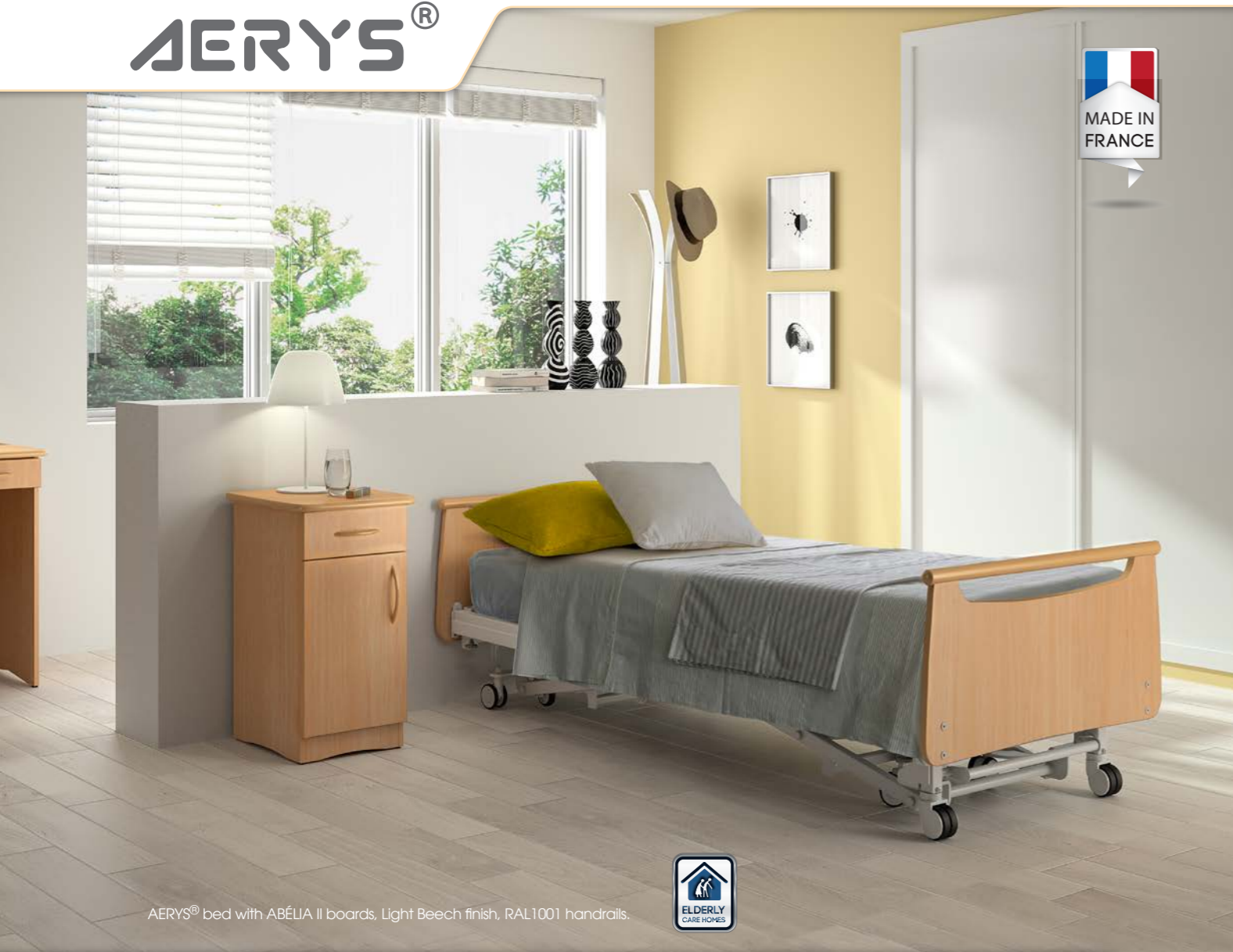
AERYS® bed with ABÉLIA II boards, Light Beech finish, RAL1001 handrails.