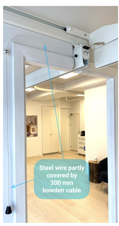
Pull the steel wire cord to activate and unlock the door connector. See step-by-step guide on next page.

TRANSITION GATE. THROUGH THE DOOR - QUICK AND EASY