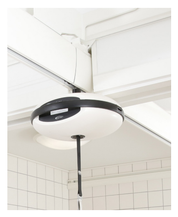
3. When the traverse is aligned with the door connector, it will automatically lock into position with a click sound ready for room to room transfer.