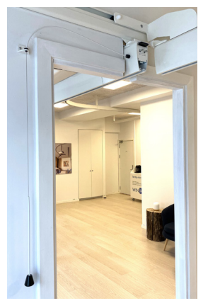
1. Pull the steel wire cord to activate the door connector.