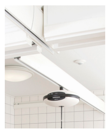
4. Once the ceiling lift has been moved into the other room, pull on the cord to unlock the mechanism and to move the traverse.