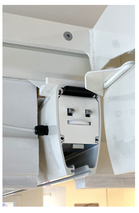
2. Slide the traverse towards the door connector.